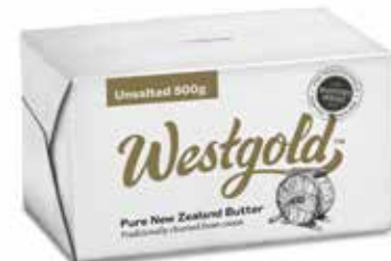
Westgold 500g Unsalted