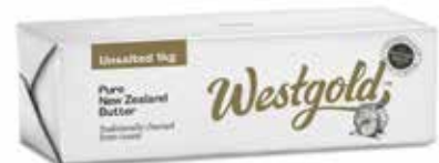
Westgold 1kg Unsalted