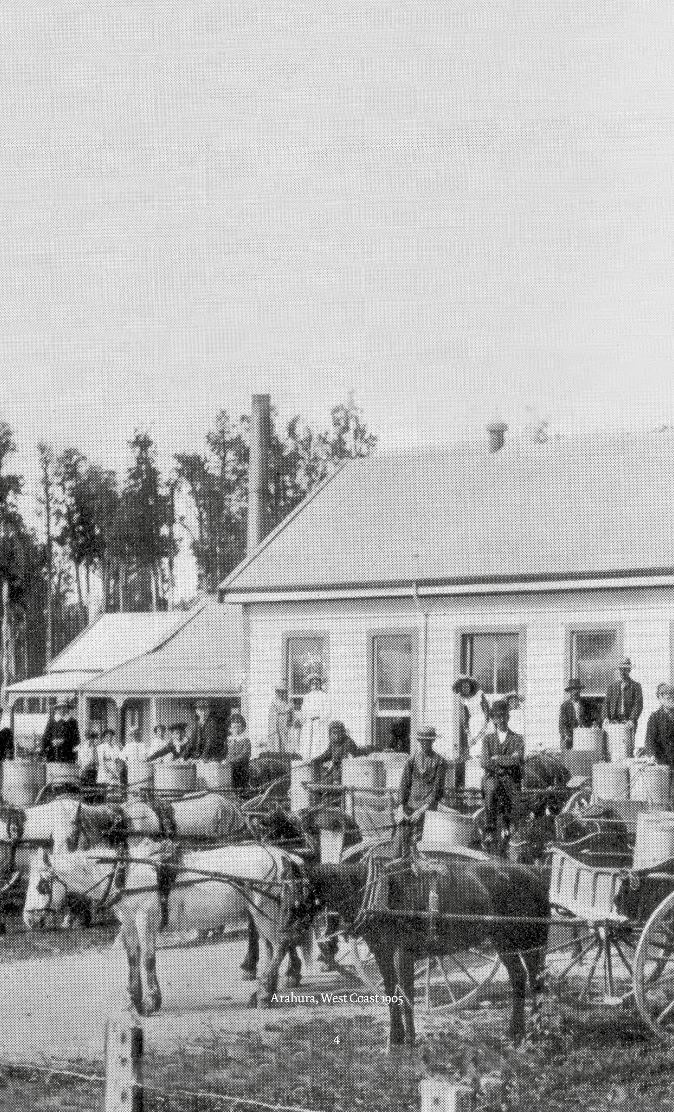
Arahura, West Coast 1905

We are proud of our past. The courageous decisions and pioneering spirit of previous generations have shaped our company into today's successful, independent, entirely dairy farmer-owned business.