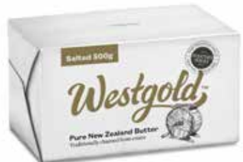
Westgold 500g Salted

Westgold butter is traditionally churned using the time-honoured Fritz Churn method to produce a creamier texture.